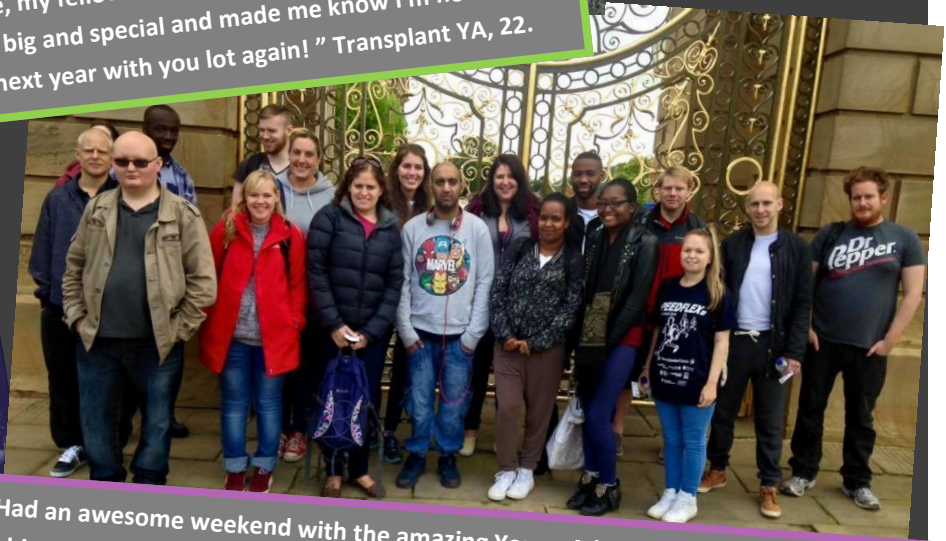
"Had an awesome weekend with the amazing Young Adults from all over the UK x I'm aching all over and tired as hell but it was all worth it x Haven't laughed so hard in so long x Love my Renal family x Thanks to everyone who made the weekend possible and to everyone who attended x Love you all x #BringonSept2016 " Transplant YA, 23