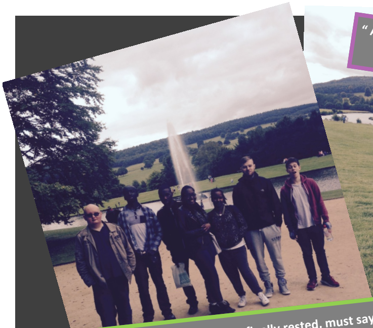
"Awesome weekend away, met some great people and now have some epic memories. Can't wait for the next one." Haemodialysis YA, 23