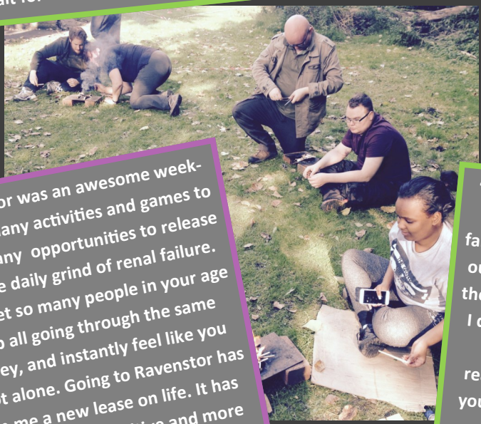
"Ravenstor was an awesome weekend! So many activities and games to do. So many opportunities to release from the daily grind of renal failure. You meet so many people in your age group all going through the same journey, and instantly feel like you are not alone. Going to Ravenstor has given me a new lease on life. It has helped me to be positive and more